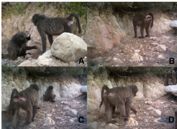
Fig. 2. Reproductive states; A , nonswelling; B , swelling; C , pregnant; D , lactating (infant is clinging to the female’s ventrum).

Occasionally, glare on cameras, condensation, or baboons positioned immediately in front of the cameras impacted video quality. Visits with poor visibility or forcible displacements were excluded